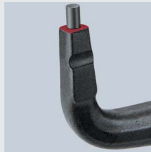
Sturdy, inserted tips: made from high-density spring steel

High-density spring steel with a score-free surface is used for the tips. This increases the tips' resistance to dynamic and static strain. The tips are 30 % more stable than conventional pliers when subjected to one-off overloading while still allowing good accessibility during assembly. Subjected to dynamic strain, the tips' resistance capacity is up to 10 times greater! The tips on the precision circlip pliers are non-detachable!